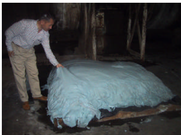
Wet blue hides

As the production of wet blue hides became too expensive with the high cost of raw material, IPS closed also its tanneries in Kenya and Tanzania.