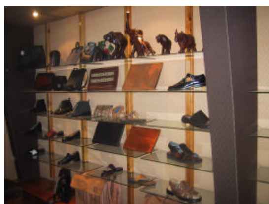
TCFC show room