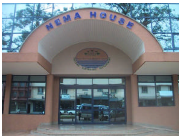
NEMA Headquarters in Kampala