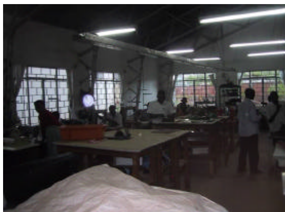
TCFC Manufacturing hall

the TCFC, as well as some renovation work in the building. The bilateral project ended in 2001. The building of the TCFC is made available by GOU free of charge.