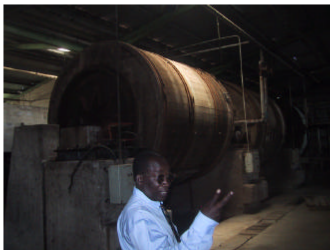
Liming and tanning drums

However, the improved quality combined with the thickness, which compares to the thickness of hides from Brazil and Rwanda, yielded higher prices for exported raw hides. About 15 – 20% of Ugandan hides can be used for upholstery. Uganda is the only country in East Africa with larger quantities of hides that are suitable for upholstery. This has also contributed to the price hike.