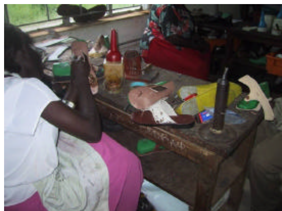
Trainee at work