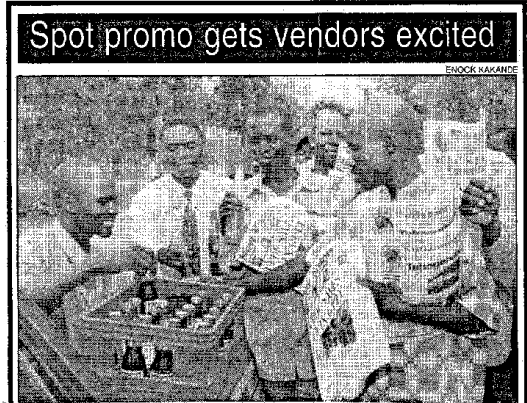
Spot promo gets vendors excited