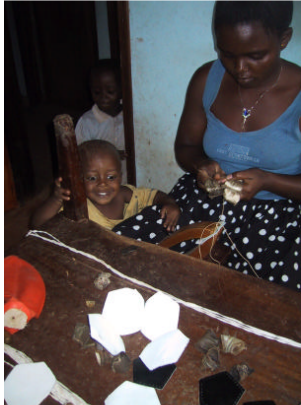
Stitcher making a football