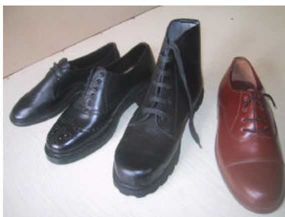
Showcase at Uganda Shoe Co.Ltd.