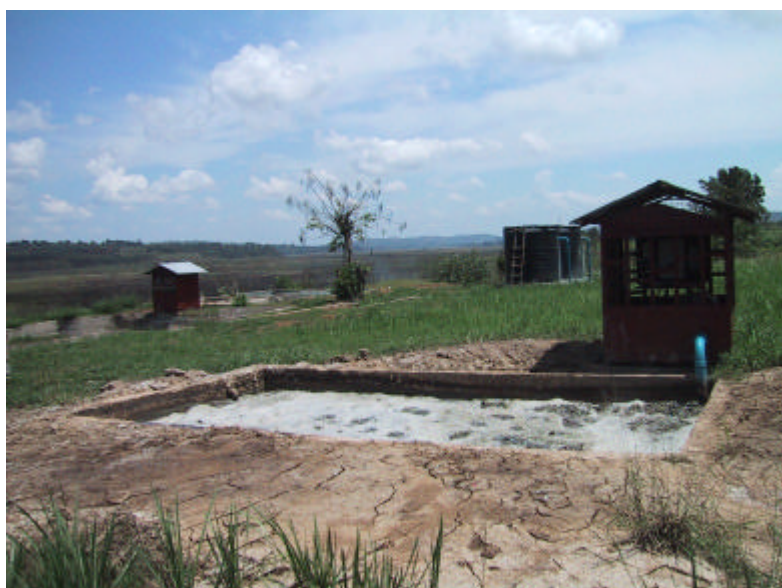
Effluent treatment plant at TALIU

According to Mr. Kasujja, TALIU buys hides in grades. It pays one price for TR (grades 1 – 3) and a lower price for grades 4 – 5.