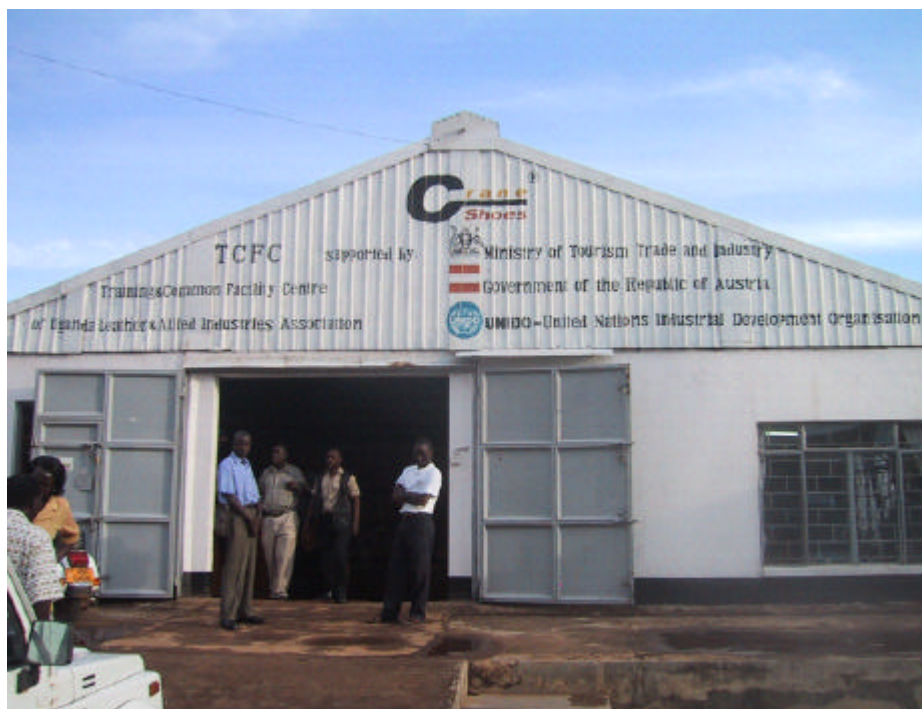
TCFC Building in Kampala