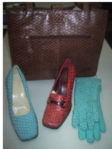
Nile perch leather and products

The tanning capacity is 4,000 Nile perch skins per day. One Nile perch has two skins (one on each side). The actual production is now 1,000 skins per day, but Gomba is hardly selling anything, except small quantities to the TCFC. In the past, there were some trial orders from Italy and the Far East. Two years ago, an Italian company has produced trial quantities shoes and leather goods from the Nile perch leather and advertised it in leather magazines. In the end, there was no follow-up business.