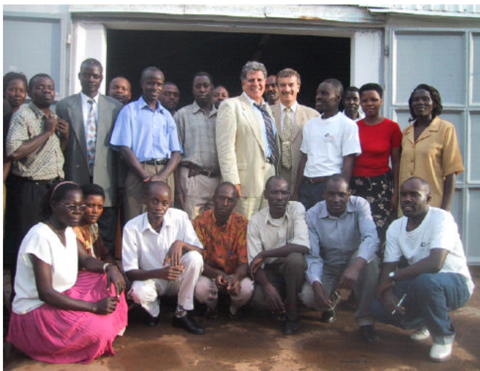
Team with TCFC entrepreneurs, managers and colleagues

Out of the 205 trainees 162 became self-employed entrepreneurs. 2 of them were employed by Bata as factory supervisors, which proves the high quality of the training. 31 trainees joined efforts and formed 11 companies. Some former trainees have trained their own employees.