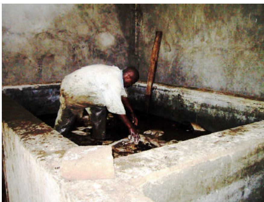
Worker in a soaking pit at TALIU