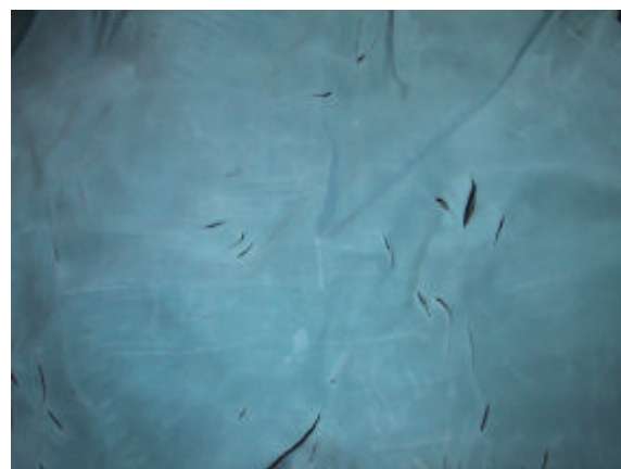
Flying cuts in wet blue hides