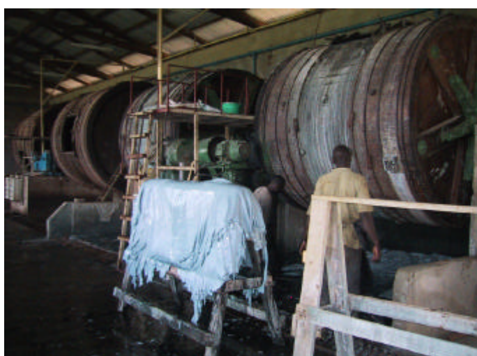
Tanning drums at TALIU

The production started only in June 2002. Currently, the enterprise tans 250 hides or 2,000 skins per day. Its capacity is 500 hides or 4,000 skins per day. The tannery has 4 drums – 2 for liming and 2 for tanning. It employs 20 people. Since the finishing line is not yet